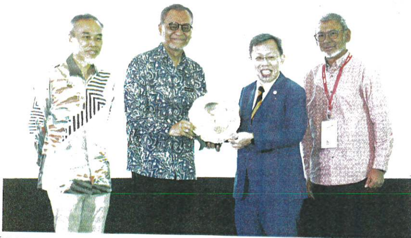
DR. DZULKEFLY (dua dari kiri) menyerahkan anugerah kepimpinan CRM kepada Timbalan Premier Sarawak, Datuk Amar Sim Kui Hian (dua dari kanan) pada Persidangan CRM Trial Connect 2024 di Kuala Lumpur semalam.

Beliau dipetik berkata, pihaknya akan meminta wakil daripada firma itu untuk membuat penjelasan lebih teliti dan telus kepada semua pihak di negara ini.